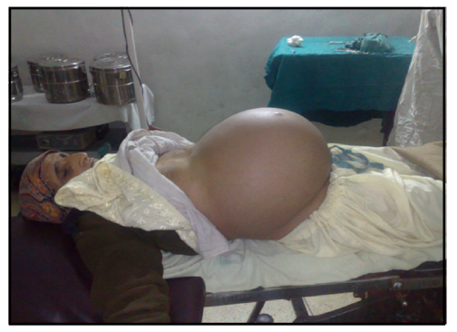
Fig1. Octogenarian Female with Huge Abdominal Mass (Ovarian Cyst)

slowly and 25.7 liters of fluid was aspirated. On decompression, it was observed that cyst was originating from left ovary. Right Ovary and Uterus were unremarkable. Total excision of the cyst was done that measured 975 gms by weight. Total Volume of the cyst was calculated to approximate 27 kgs. Histopathological examination suggested benign mucinous cyst adenoma of the Ovary. ( Fig. 1-3 )