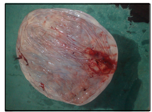
Fig2. Ovarian Cyst wall after its Excision (975 gms by weight)

The definition of huge ovarian cysts has not been well described in the literature. Some authors define large ovarian cysts as those more than 10 cms in diameter measured on pre-operative scan. Others define large ovarian cysts as those reaching above the umbilicus. (11,12) The case under report well fits into the criteria of giant/large ovarian cyst, it being 58 by 46 cm in cranio-caudal dimensions on ultrasound/CT scan and extending up to tip of xiphoid process. Benign Mucinous cyst adenoma is reported to occur in middle-aged women. It is rare among adolescents (13,14) or in association with pregnancy. (15) Furthermore, the studies in the literature substantiate the rarity of ovarian cysts in elderly females. (16, 17) Ours was an octogenarian female and mucinous